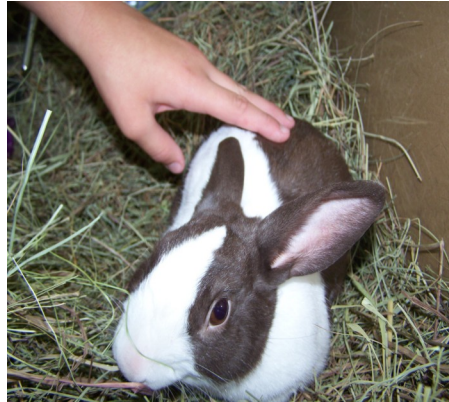
Lots of fun animals!

wouldn't get hurt anyway since there was a net under him. It was a lot of fun.