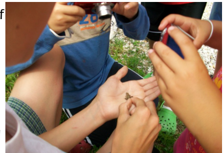
Calvin finds and everyone rushes to get a snap.