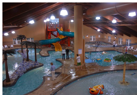
Honey Creek Buccaneer Bay Water Park

Honey Creek is a fun place to go. Hone creek has a big hot tub and a big water slide. They had monkey bars over the water. There were lots of toys floating around in the water. I think people would enjoy family trips to Honey Creek Resort! (ed: Hint Moms and Dads!)