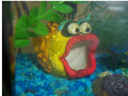
Algae can clearly be seen on Mrs. Puffer fish.

So far five suspects exist. First, we think he might have had a piece of moldy food. Second, the tank is dirty, so it might have been the algae. Third, maybe a piece of plastic clogged the filter. Last, there are two other fish, Sharkie